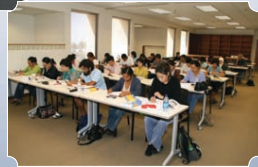
SCE Classroom at Anaheim Campus