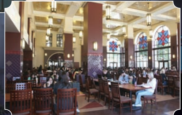
Fullerton College Center Diningroom