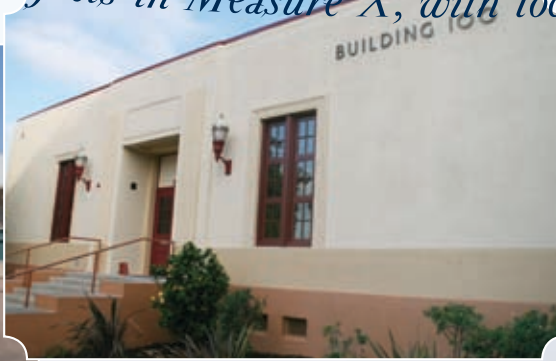
SCE Wilshire Center in Fullerton