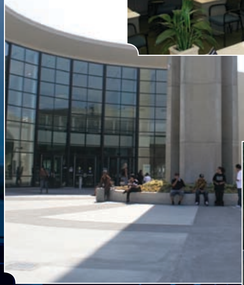
Cypress College Student Center/Bookstore