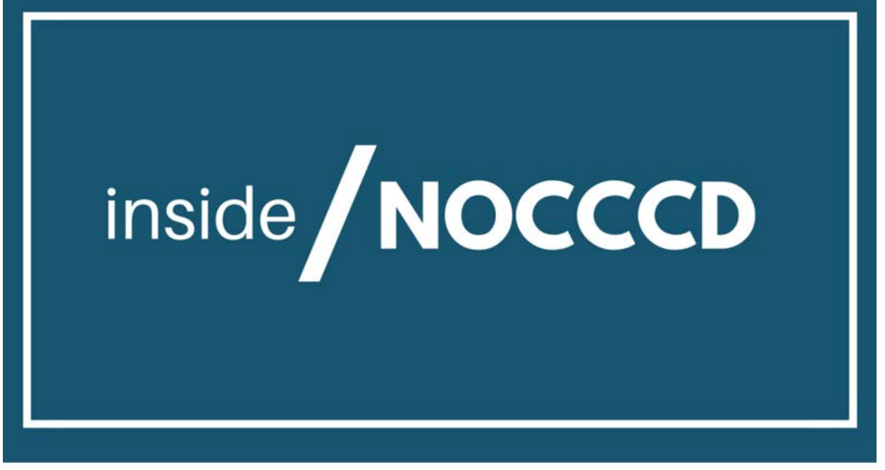
Distributed April 28, 2016