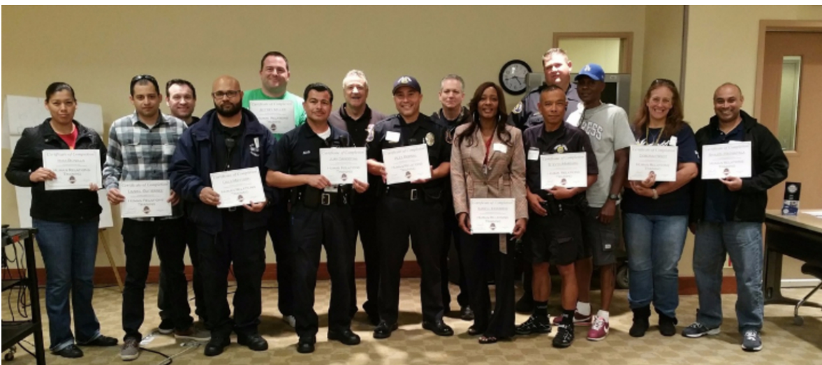
Campus Safety Officers with their Certificates of Completion